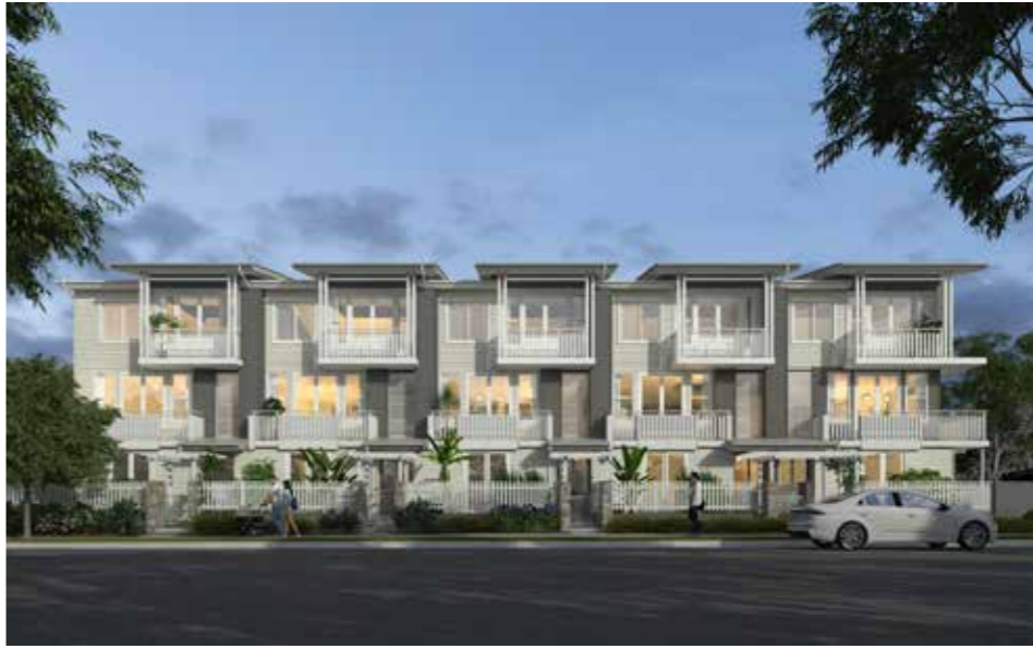
HAMILTON Under Construction Location: Hamilton 5 High End Homes Developer: Melthorn Development Group