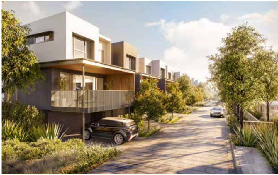
THE ORCHARD Under Construction Location: Arana Hills 77 Townhouses Developer: Tessa