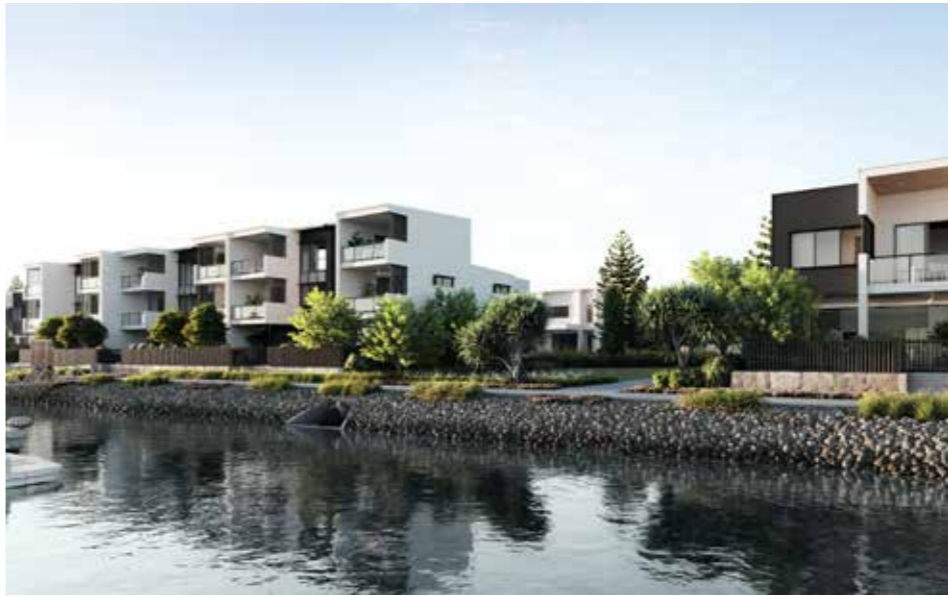
DELTA Under Construction Location: Hope Island 91 Townhouses Developer: Stockland